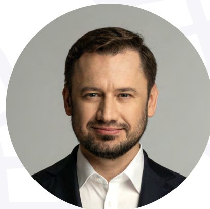
Aleksander Miszalski Mayor of the City of Krakow