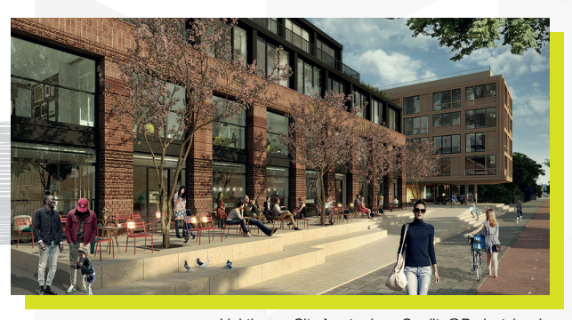
Lighthouse City Amsterdam.

Amsterdam is transforming a former industrial neighbourhood into a low-carbon, smart PED with mixed uses to explore opportunities for local energy communities: new energy efficient buildings, a high share of renewable energy sources generating solutions and smart technology will be deployed. Citizens are involved in the design of the environment (e.g. the car sharing facilities) and evaluations of the various demonstrators.