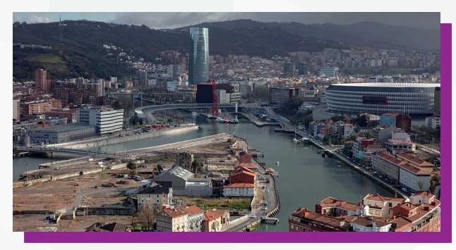
Lighthouse City Bilbao.

The demo district of Zorrotzaurre is an industrial brownfield that will become a city lab where the city of the future will be designed. On this island, new policies are being developed to foster a transition towards a zero-emission city model, including initaitives in transportation, heating and cooling and power generation, distribution and management. The aim is to develop 5,500 new homes, 150,000 m² of office space, 154,000 m² of citizen spaces and 93,500 m² of social and cultural facilities. The local PED will be developed in three locations as part of Zorrotzaurre island: North, Centre and South, which will be connected via a geo-exchange loop.